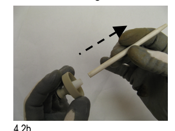
To reinstall Injector to the D-Torch

Repeat steps 4.1 and 4.2 in reverse order.