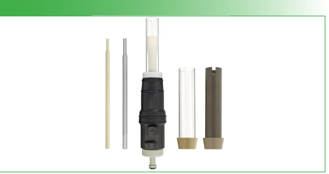
Figure 1: Glass Expansion D-Torch for Agilent 5100/5110 and 5800/5900 ICP-OES instrument.

The D-Torch (Figure 1) is a robust and higher-performing alternative to both a single-piece and a semi-demountable quartz torch. Compared to other demountable torches, the D-Torch is the only torch design that comes standard with a ceramic intermediate tube for greater robustness and a lower cost of ownership. With the D-Torch design, the analyst most often replaces only the outer tube, rather than replacing the entire torch or a quartz torch body. With demountable torch designs offered by other manufacturers, the intermediate tube is made of quartz and fused to the quartz outer tube, which is an additional consumable whose cost can quickly add up and negate the economic benefits of the torch itself. The D-Torch also features fully interchangeable injectors, allowing the analyst to install a specific injector (i.e., material and inner diameter) for each application, whether it be for aqueous,