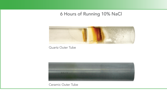
Figure 2: A Comparison of resistance to devitrification when exposed to high salt matrix.